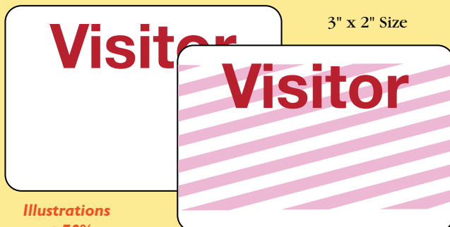
Illustrations at 70%

Visitor, Temporary, Vendor, Contractor imprint, half-day, one-week, one-month expiration time-frames ... ask for a FAST QUOTE