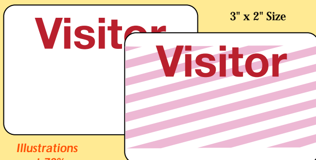
Illustrations at 70%

Visitor, Temporary, Vendor, Contractor imprint, half-day, one- week, one-month expiration time-frames ... ask for a FAST QUOTE