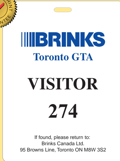
VB-101 (3 3 / 8 "x2 1 / 8 ") VB-102 (4"x3")

Visitor Badges. One colour laminated imprint on white PVC plastic (0.030" thick). Slot hole ( strap/clip extra ). Prices each badge.