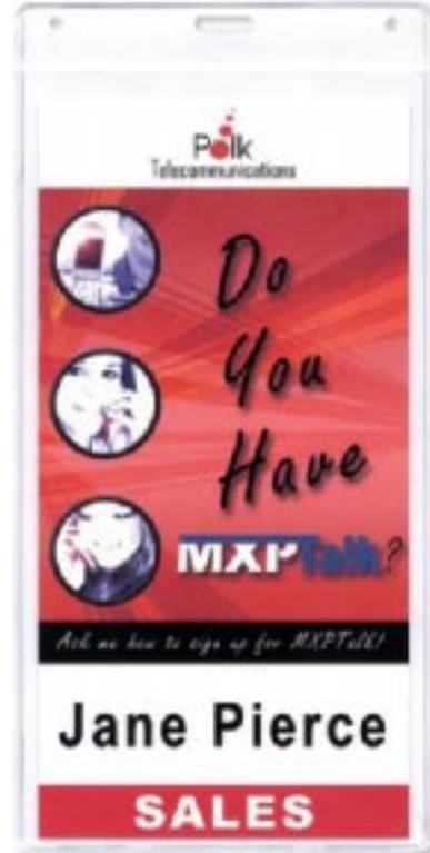
Style 740-V Slotted (4" x 8")