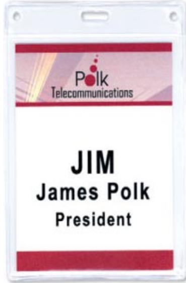
Style 730-V Slotted (4" x 6")