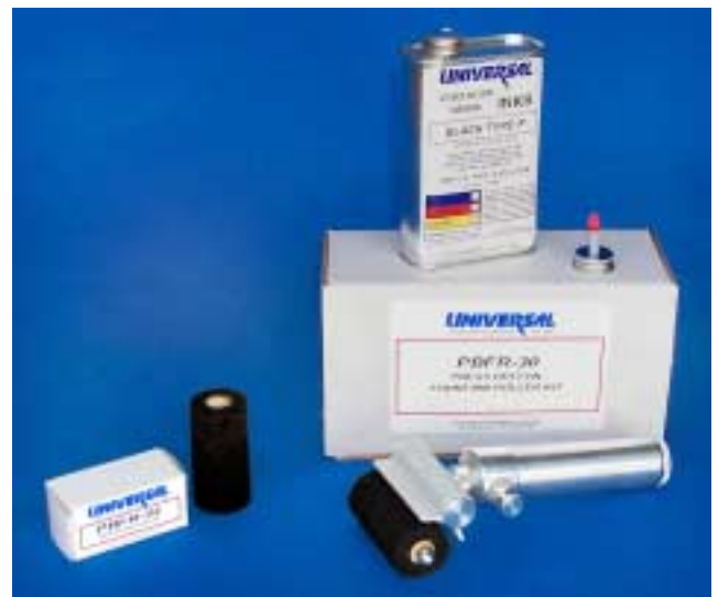
PBFR-32 Replacement Roller sold separately

Universal PBFR-32 Replacement Rollers are made from the highest quality, firm density neoprene foam which is bonded to solid birch wood cores using solvent resistant epoxy. Our rollers are then precision ground between centers, for perfect concentricity. After prolonged use, a worn roller can be replaced in a matter of seconds to restore the unit to its original operating performance. For best results, it is generally recommended that the PBFR-33 Felt Wick be replaced when new rollers are installed.