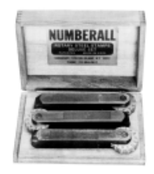
** Plastic pouches or wooden boxes furnished for sizes through 1/4" only.

FIGURE ROTARY STAMP furnished in plastic case** 1 2 3 4 5 6 7 8 9 0 x - (all on one wheel) LETTER ROTARY STAMPS furnished two in a box** A B C D E F G H I J K L M N & (on wheel of one stamp) N O P Q R S T U V W X Y Z - (on wheel of other stamp)