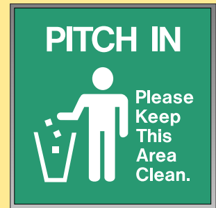
FF-6.6 Frame ... $42.80 6" x 6" Inside Dimensions