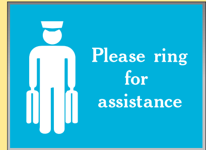
FF-8.6 Frame ... $44.80 8" x 6" Inside Dimensions

Dividers are available either horizontal, vertical or both ...ask for a FAST QUOTE