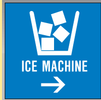
FF-4.4 Frame ... $35.80 4" x 4" Inside Dimensions