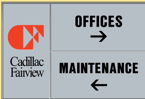
FF-12.8 Frame ... $60.80 12" x 8" Inside Dimensions

PRODUCT DATA SHEET FS-101 ... Facility Signs