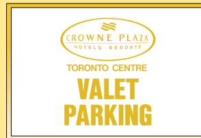
FF-6.4 Frame ... $37.80 6" x 4" Inside Dimensions