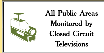
FF-8.4 Frame ... $39.80 8" x 4" Inside Dimensions