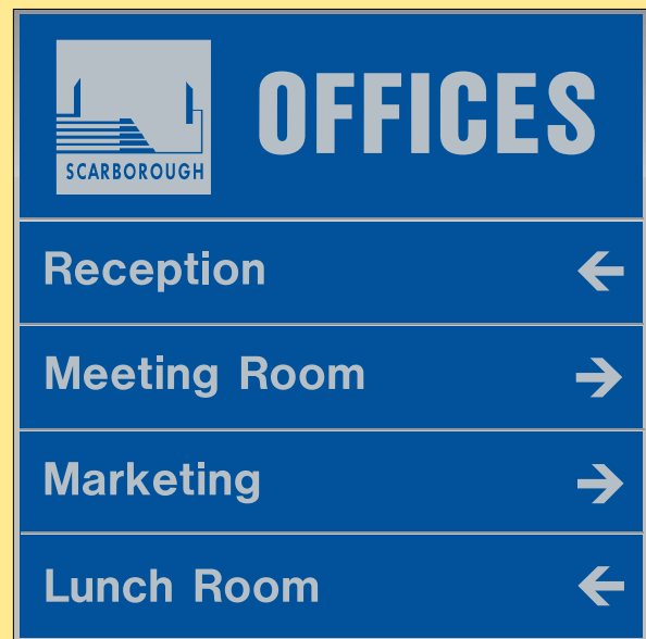
FF-12.12 Frame ... $68.80 12" x 12" Inside Dimensions