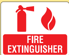
FM-115 (10"x8") $38.80