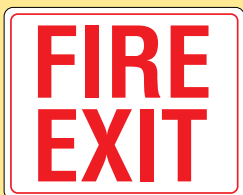
FM-103 (10"x8") $38.80