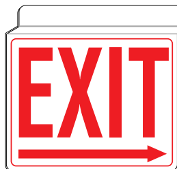
FM-106R-TA (10"x8") $77.80