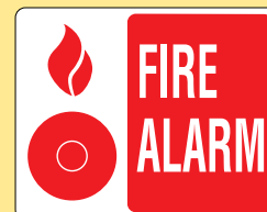
FM-114 (10"x8") $38.80