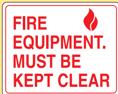
FM-112 (10"x8") $38.80