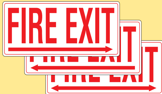
FM-107R (18"x8") $59.80 FM-107L (18"x8") 59.80 FM-107RL (18"x8") 59.80