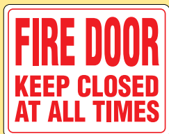
FM-104 (10"x8") $38.80