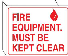
FM-112-RA (10"x8") $77.80 (c/w Foam Adhesive)

Right Angle Style (RA) Triangular Style (TR)