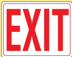
FM-101 (10"x8") $38.80