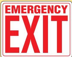
FM-102 (10"x8") $38.80