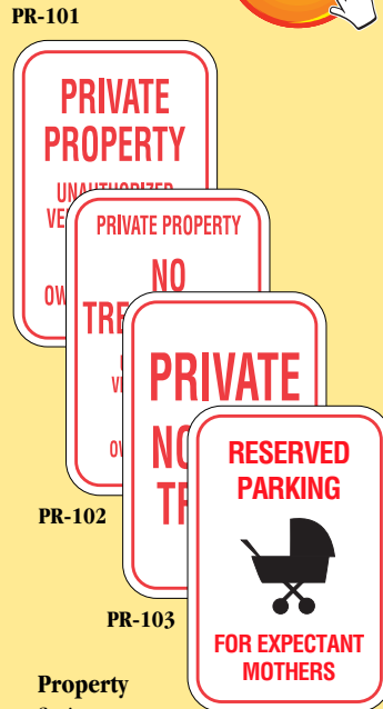
Property Series (12"x18") $38.80 each