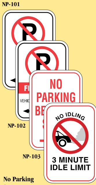
No Parking Series (12"x18") $38.80 each

Made of 0.051" thick white enamel painted aluminum