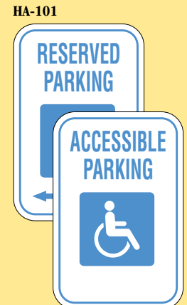
Handicap Series (12"x18") $38.80 each