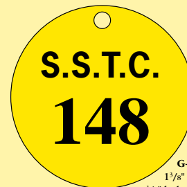
G-137 1 3/8" dia. 1/8" hole