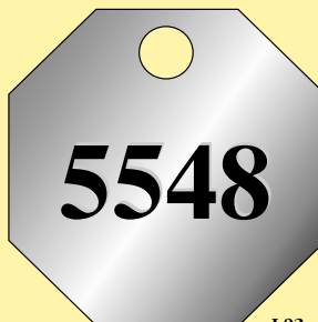
J-92 1 1/2" Octagon 1/4" hole