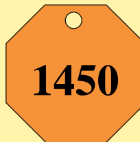
D-124 1 1/16" Octagon 1/8" hole