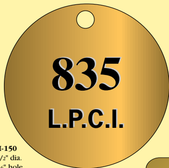
I-150 1 1/2" dia. 3/16" hole