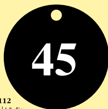
D-112 1 1/8" dia. 1/8" hole