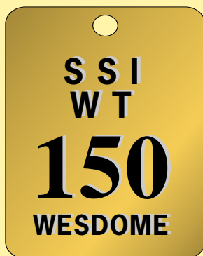
P-95 1 1/2" x 1 7/8" 3/16" hole