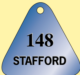
F-128 1 1/16" x 1 3/16" 1/8" hole