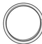
Split Key Rings