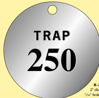
R-200 2" dia. 3/16" hole